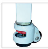
Footmaster Caster Universal caster with brake and leveling feet