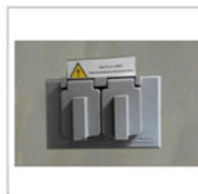
Waterproof Socket 2 waterproof sockets are located in the side wall, for optimum convenience of using small devices inside the cabinet.