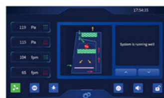
Display for BSC-4FB2-NA