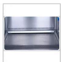
Work Zone Work zone, made of 304 stainless steel, is surrounded by negative pressure.