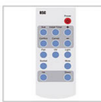
Remote Control All functions can be realized with it, making the operation much easier and more convenient.