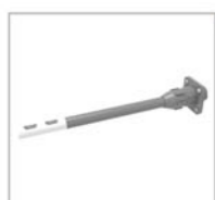
Wind Speed Sensor

Color Touch Screen Touch operation, real-time and clearer display of various values and appointment timing function.